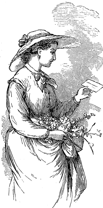
“From John, good fellow.”

S PRINGDALE was one of those beautiful rural towns whose flourishing aspect is a striking exponent of the peculiarities of New-England life. The ride through it presents a refreshing picture of wide, cool, grassy streets, overhung with green arches of elm, with rows of large, handsome houses on either side, each standing back from the street in its own retired square of gardens, green turf, shady trees, and flowering shrubs. It was, so to speak, a little city of country-seats. It spoke of wealth, thrift, leisure, cultivation, quiet, thoughtful habits, and moral tastes.